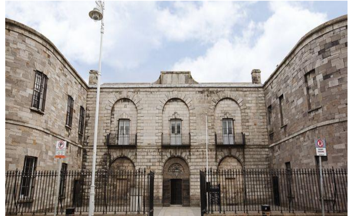
KILMAINHAM GAOL MUSEUM